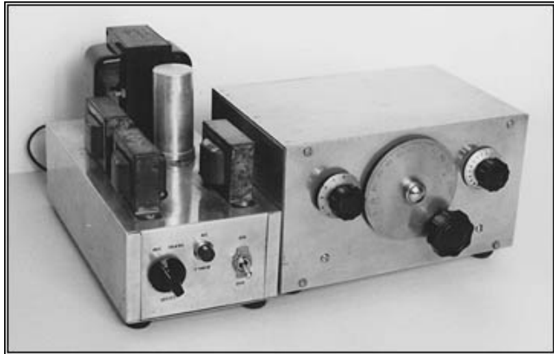
Figure 3. The Novice Special receiver and its power supply. The power supply has been modified as explained in the text.

I tried to improve the set's performance by using the RF amplifier portion of a vacuum tube TR switch described in the 1964 edition of the ARRL Handbook and found that it was most useful on 40 meters. The radio would probably be adequate for QRP (low power) work, but I have not used it for 2-way communication.